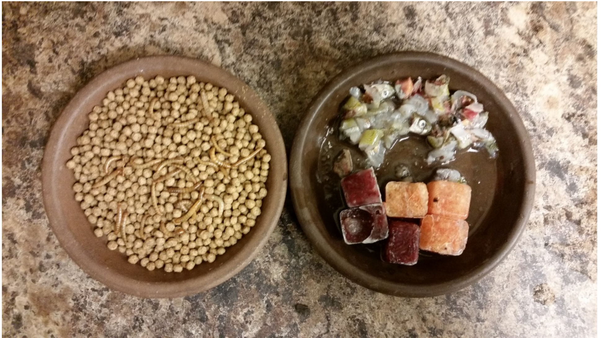
food selection for merganser ducklings: Mazuri waterfowl starter, chopped silversides, bloodworms, krill