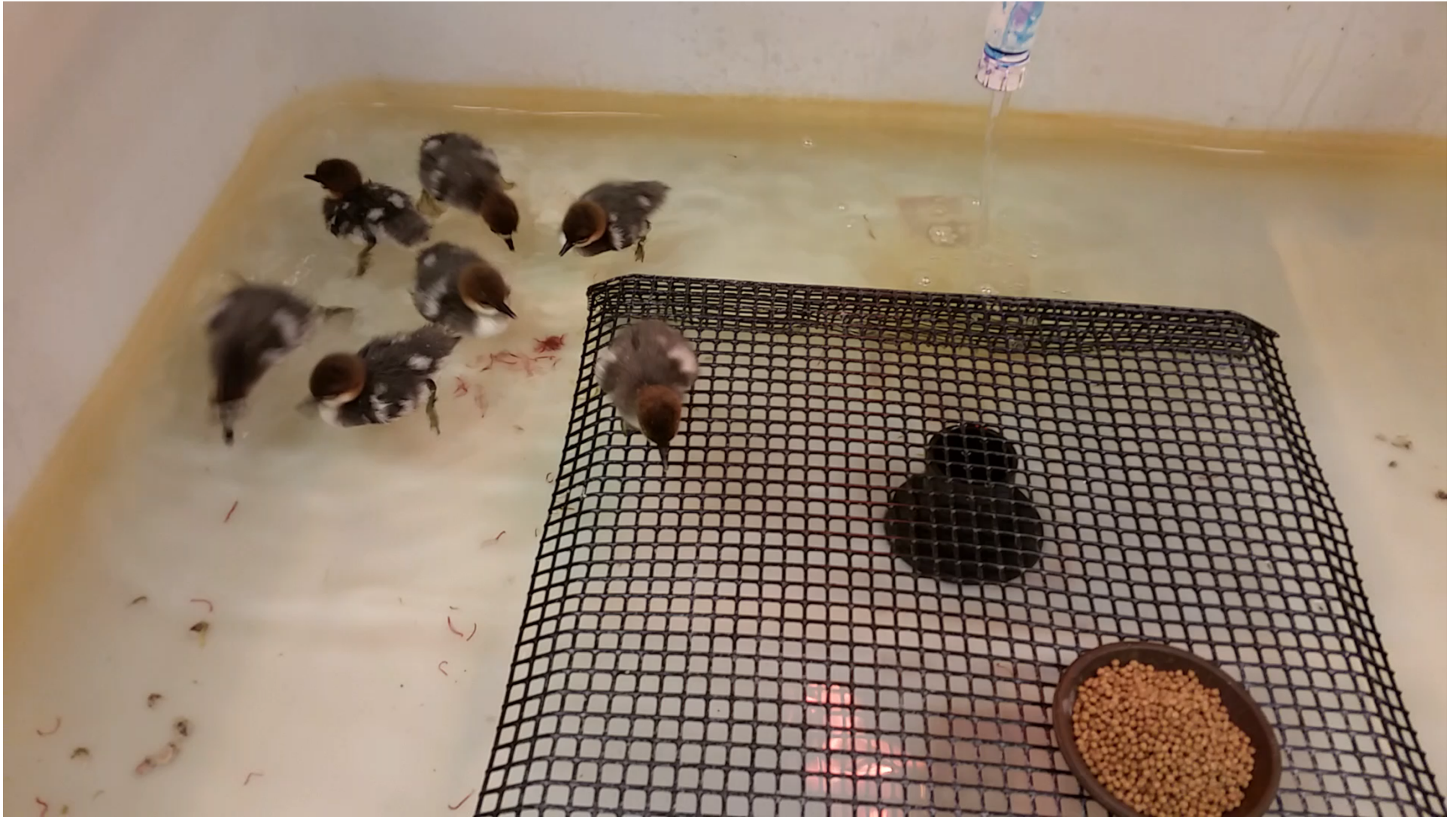
video of scaly-sided merganser ducklings feeding