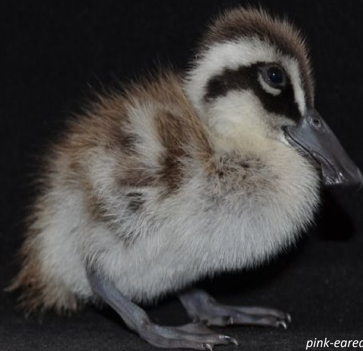
pink-eared duck duckling