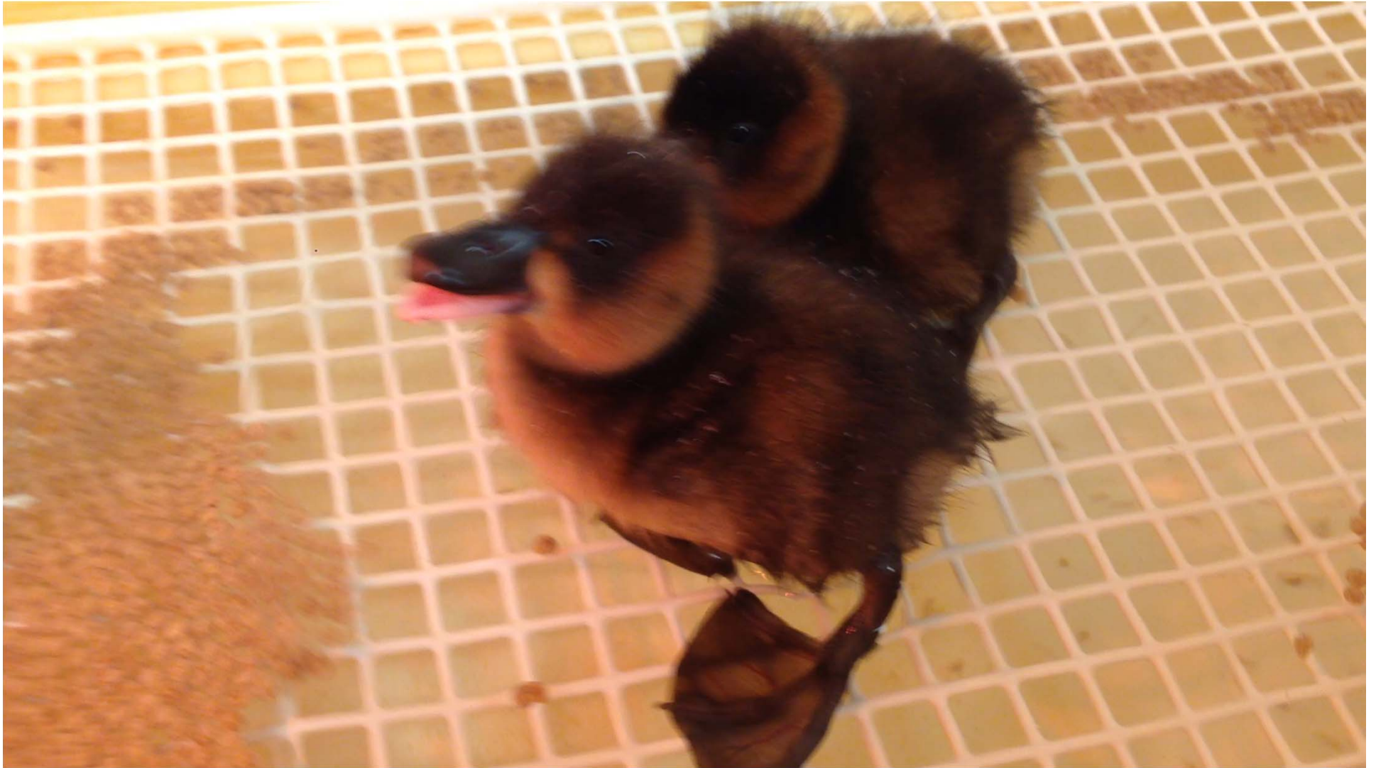
video of white-backed duck ducklings feeding in wet brooder with modified floor