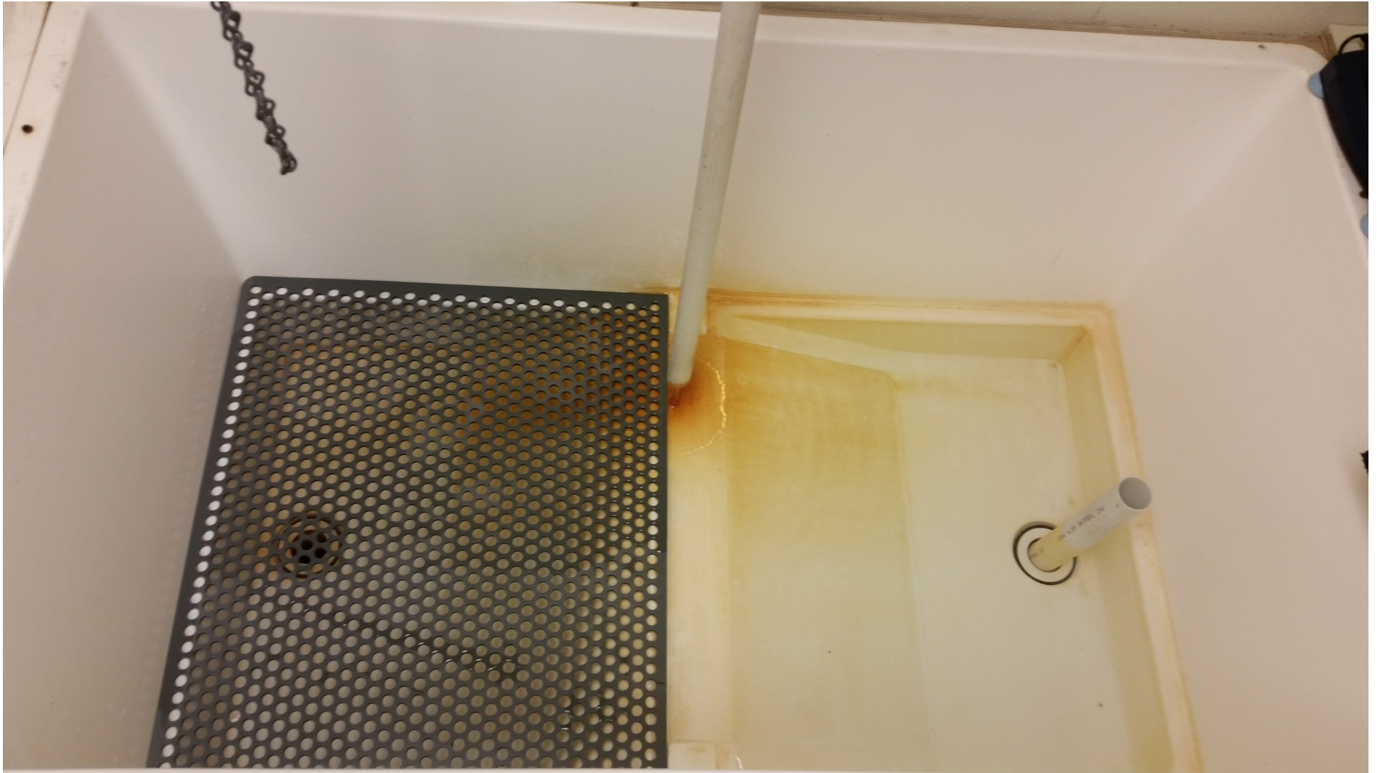
typical wet brooder set-up for waterfowl