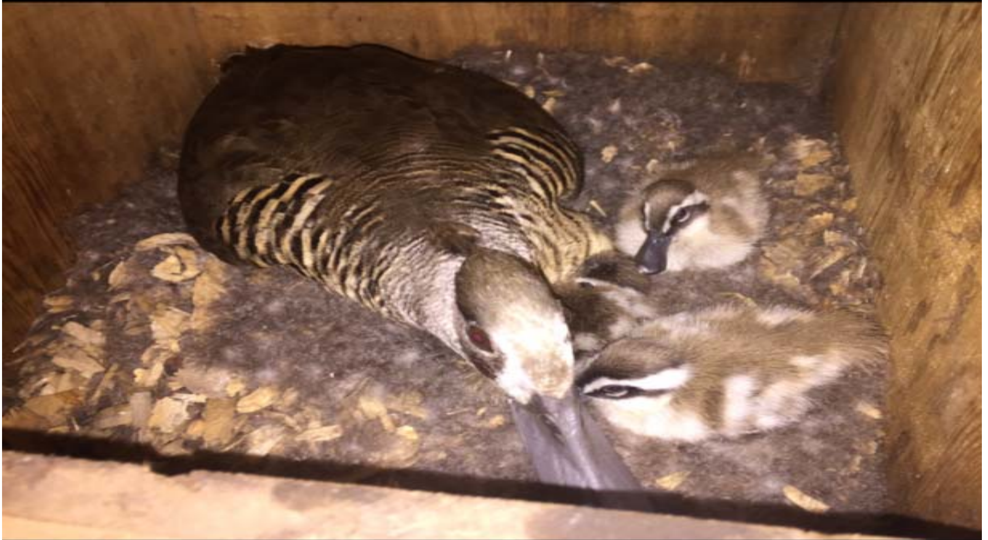
pink-eared duck hen with ducklings in nest