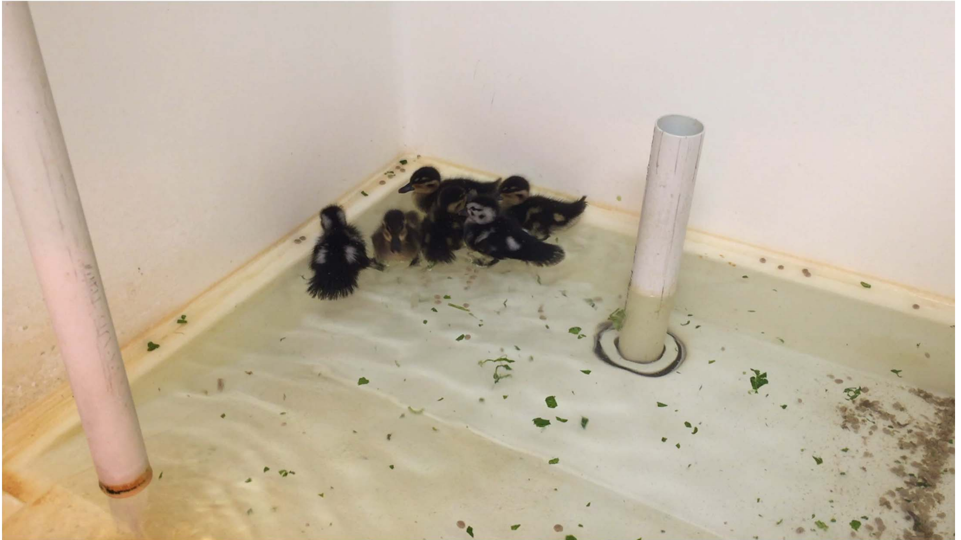
African pygmy goose ducklings with hottentot teal ducklings