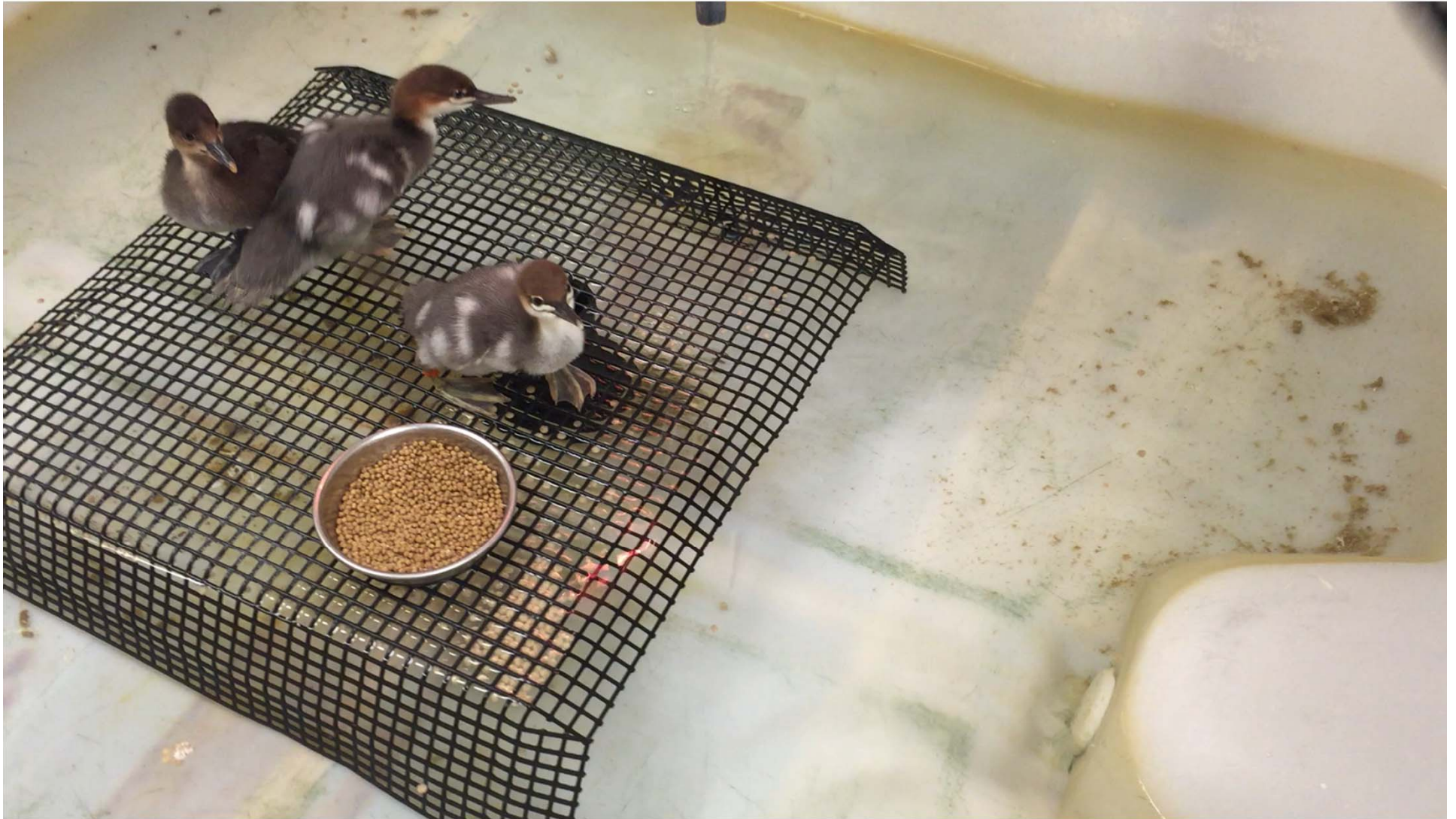
older scaly-sided merganser ducklings feeding on live minnows