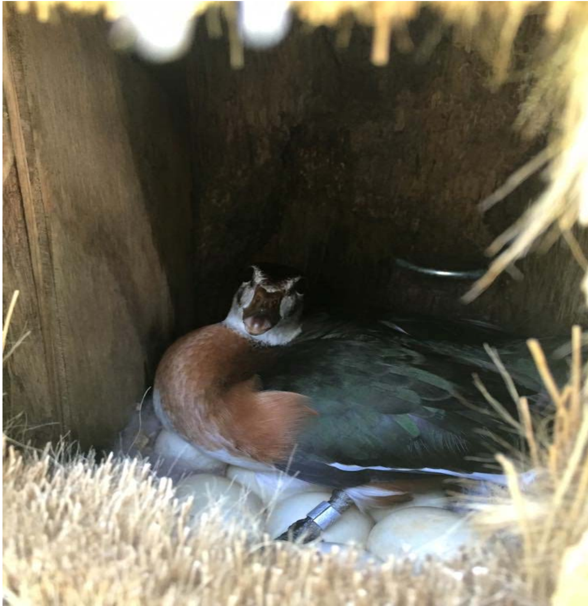
African pygmy goose nest