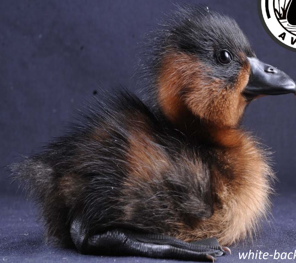
white-backed duck duckling