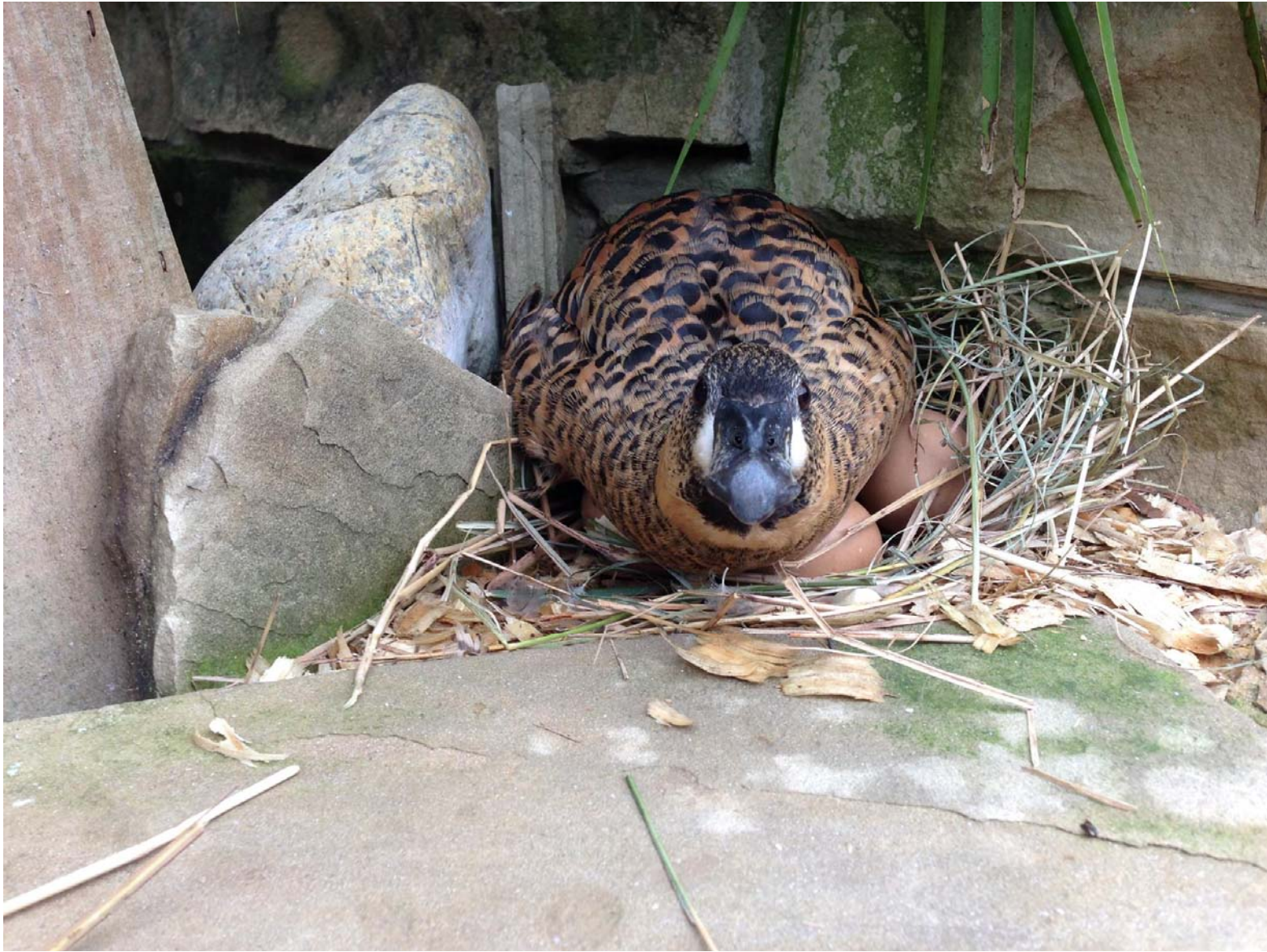
white-backed duck nest