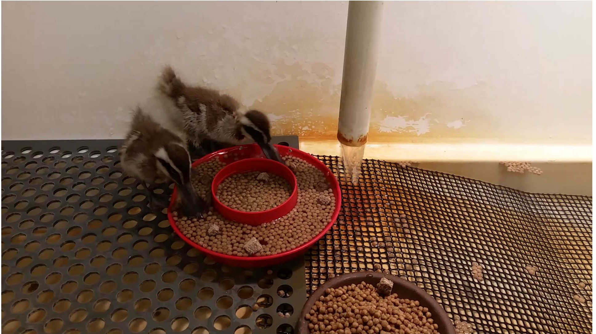
Pink-eared duck ducklings feed in a shallow dish. Seems to be the preferred feeding method for ducklings.