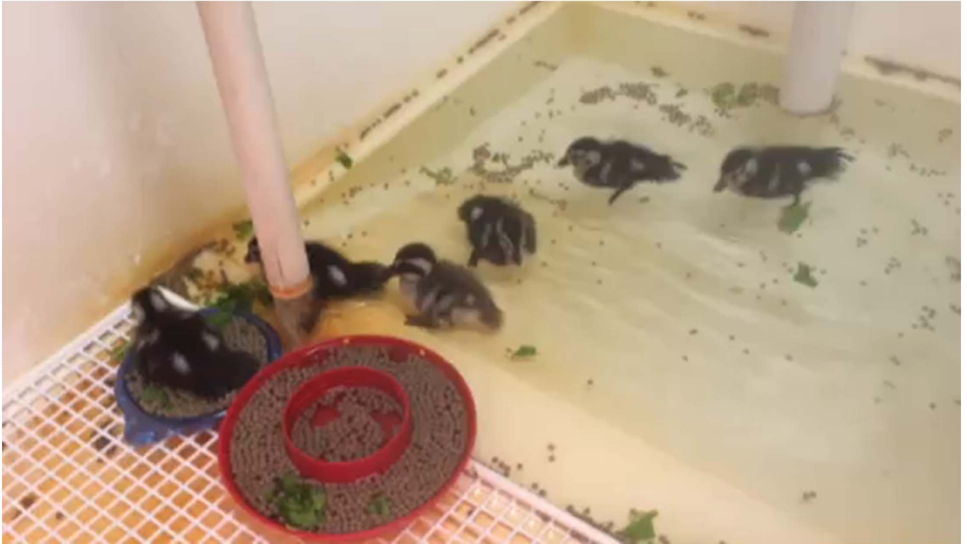
Video shows African pygmy goose ducklings and pink-eared duck duckling feeding in a wet brooder. Note the variety of ways the food is offered to stimulate curiosity and feeding.