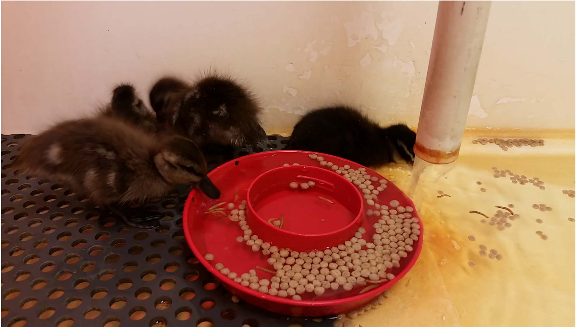
video of white-headed duckling feeding with teacher Puna teal ducklings