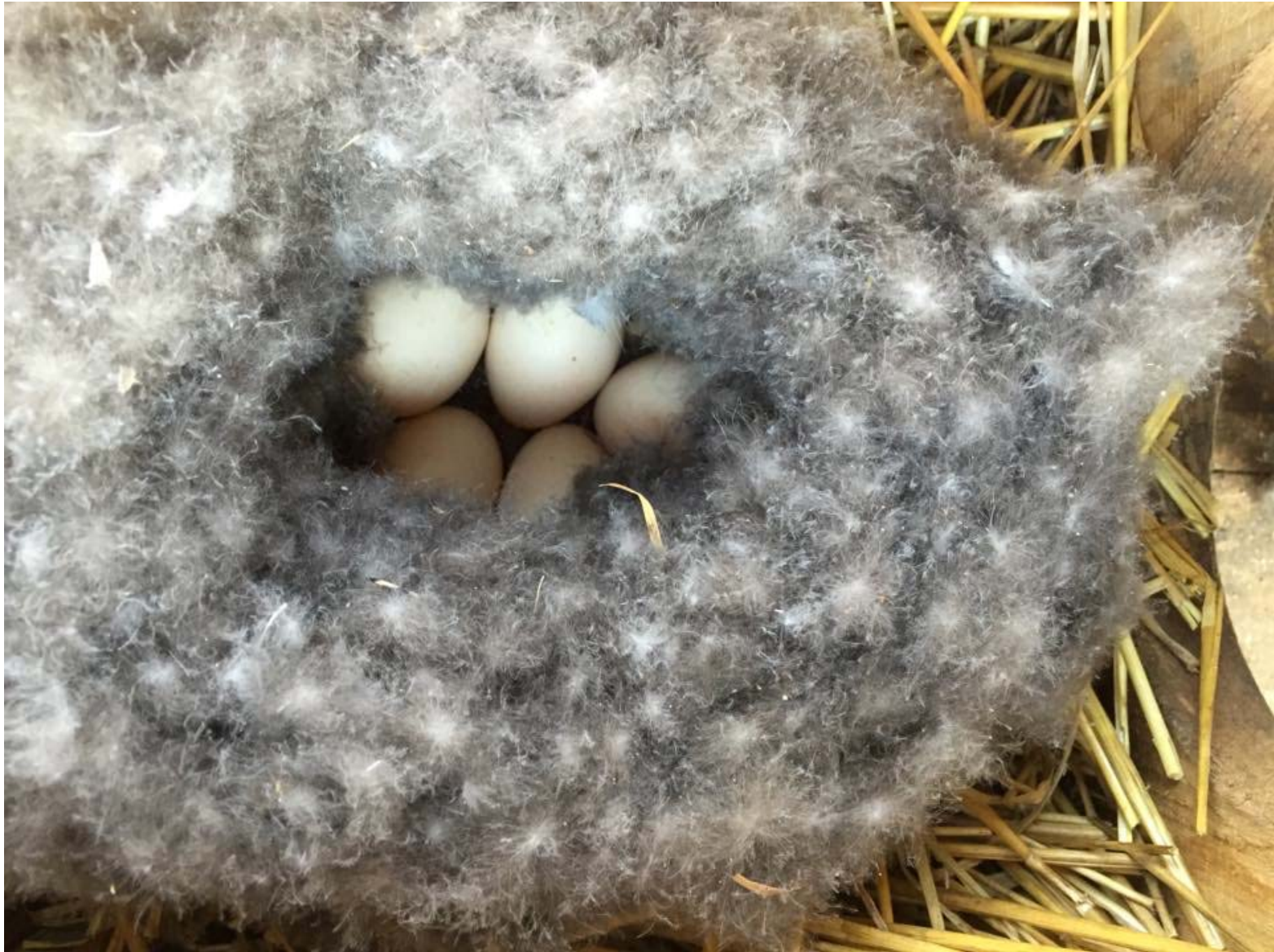
pink-eared duck nest