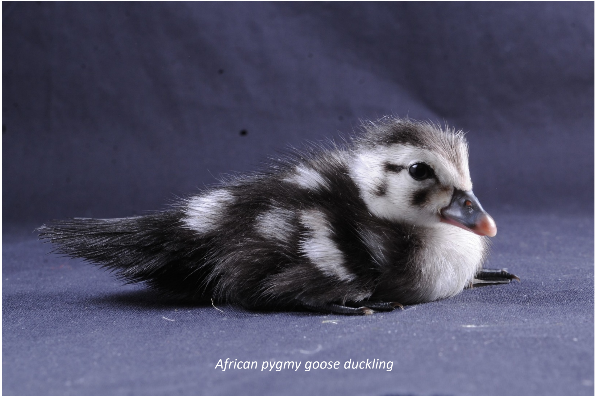
African pygmy goose duckling